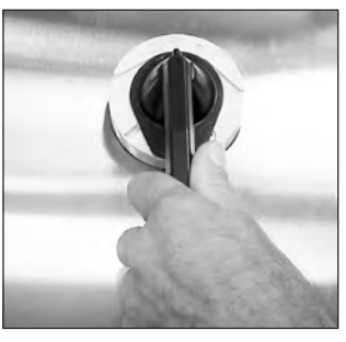
Main Circuit Breaker Switch in the OFF position