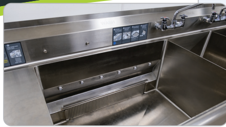
Vortex Wash Jet System