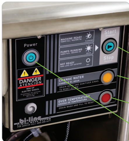
Vortex Control Panel