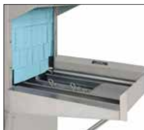
Cantilever Sideloader (No hood)

90° Corner Conveyor Table Also available NEW CCT 180 180° Corner Conveyor Table