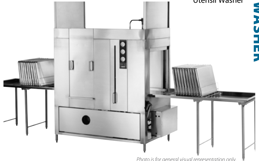
Photo is for general visual representation only. Please refer to specifications for the latest detailed product information.